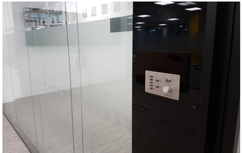
Custom Scene Plate installed on one of our sites, Wimbledon Bridge House (above).

The maximum number of 2-wire Scene Plates and PIRs on a ten on a single DALI 64.